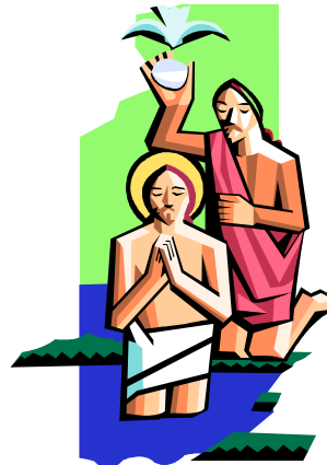
Baptism of Our Lord Sunday, January 9, 2005